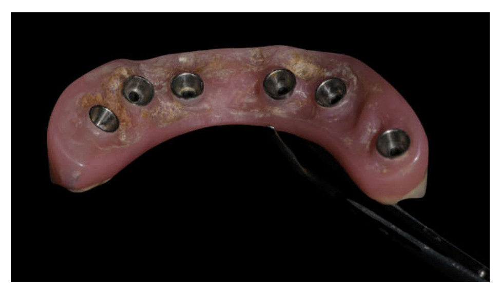
Figure 3. The internal part of the prosthetic restoration, the one in contact with the mucosa, shows the incorrect shape of the pink flange, which leads to the accumulation of plaque and food.