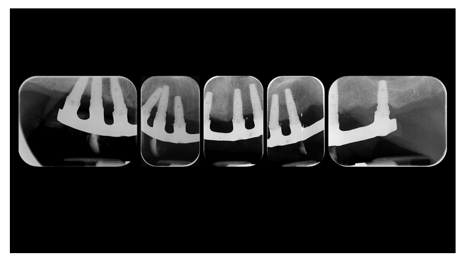
Figure 4. Radiographic status of the previous restoration.