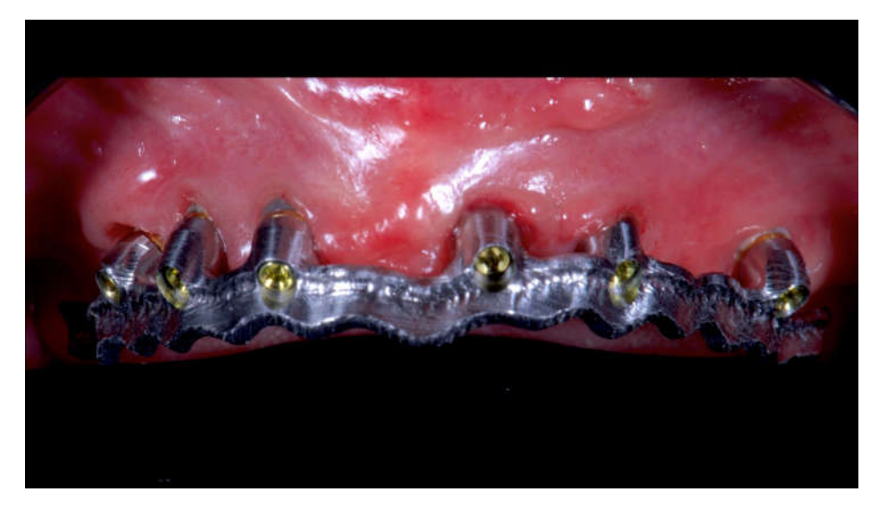
Figure 12. Single frame titanium bar mounted in maxillae with OT Bridge system.