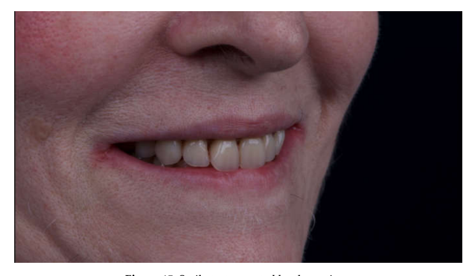
Figure 15. Smile test accepted by the patient.