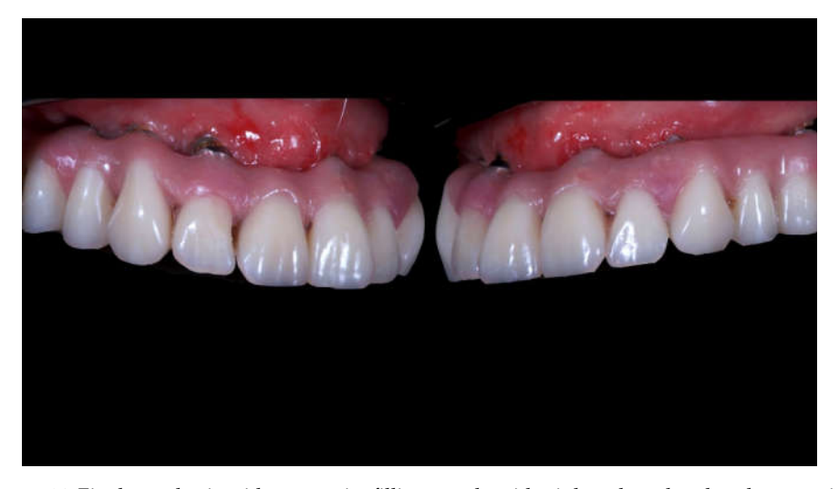
\textbf{Figure 14.} \ \textbf{Final prosthesis with composite fillings made with pink and tooth-colored composite.}