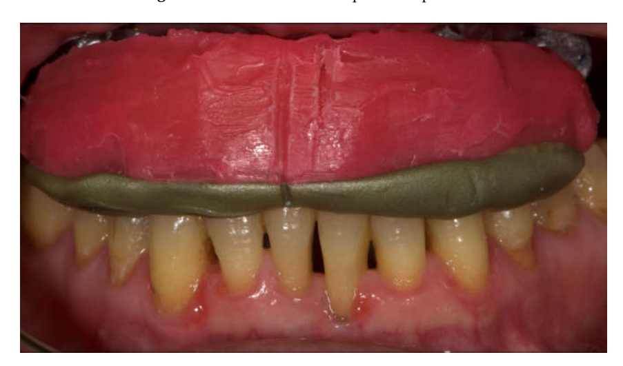
Figure 10. Vertical dimension of occlusion.