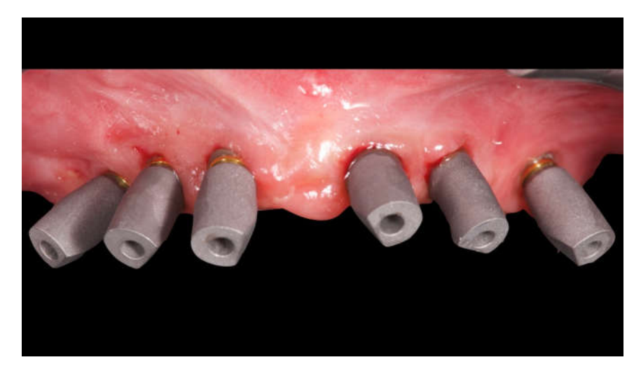
Figure 7. Scan bodies mounted on OT Equator. Note the strong disparallelism among the dental implants.