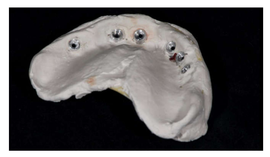
Figure 9. Internal detail of the plaster impression.