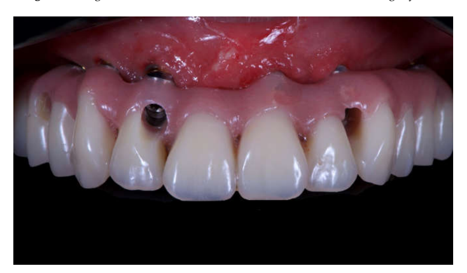
Figure 13. Final prosthesis mounted. Note the through holes. In two cases, it was compensated with only the Seeger , without a through screw.