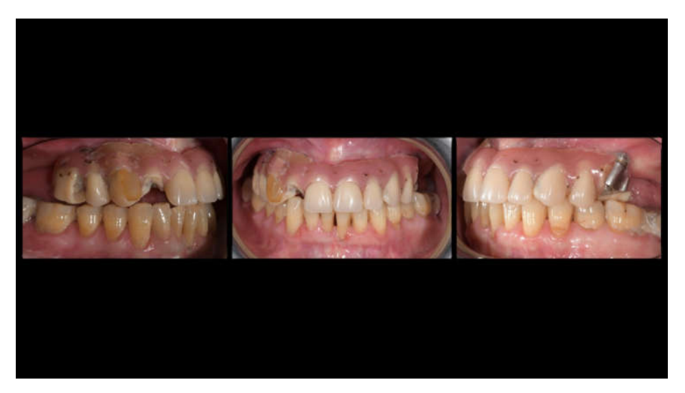
Figure 2. Pictures of detachments of tooth parts and pink resin from the prosthetic restoration.